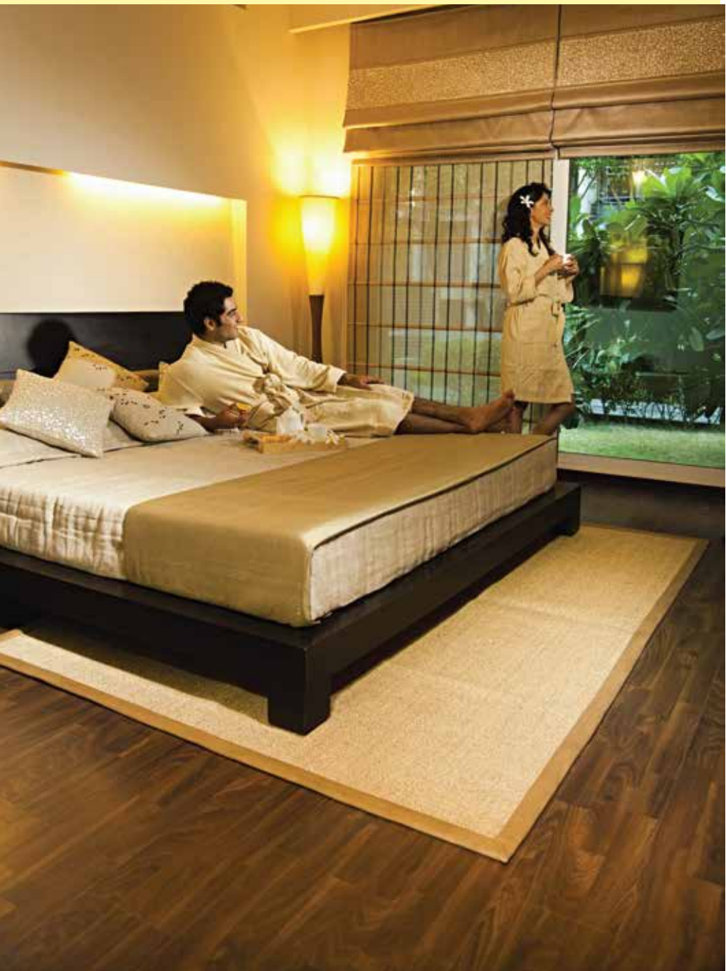
Laminated Wooden Flooring ▲