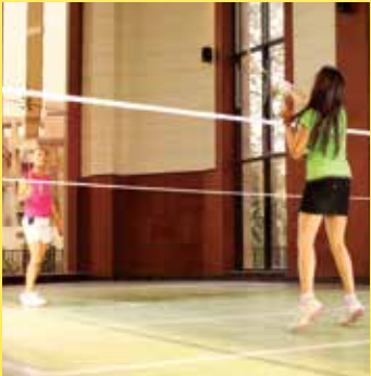
Badminton cum Banquet Hall