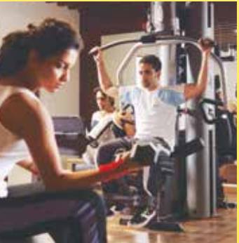
Fully-equipped gym with steam rooms