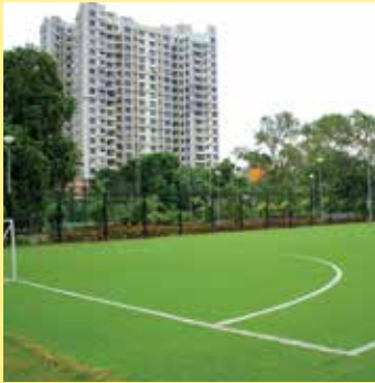
Synthetic grass surface football arena