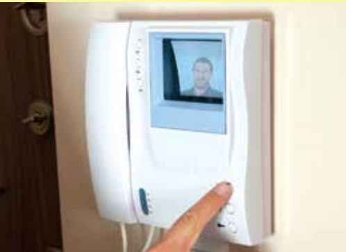
Video Door Phone ▼