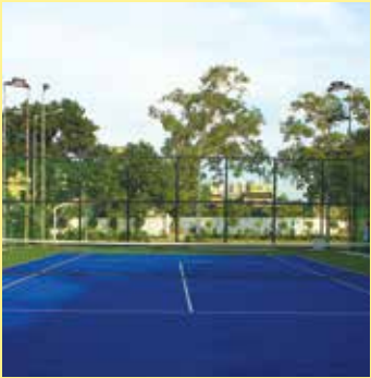
ITF 4 Standard synthetic grass tennis court