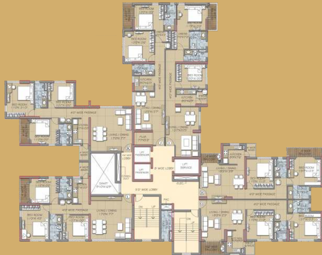
Typical floor plan | Wing - B | 1 st to 23 rd

Your golden dream is about to be fulfilled. Book Now!