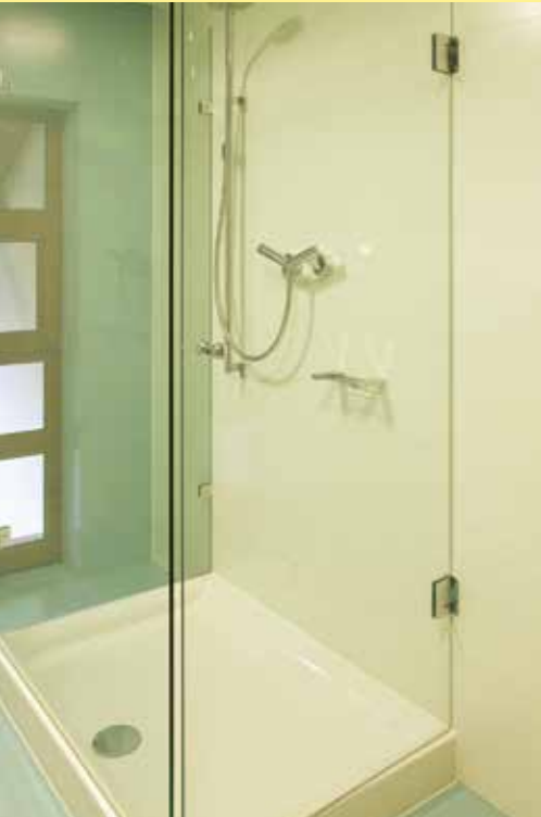
Shower Partition ▼