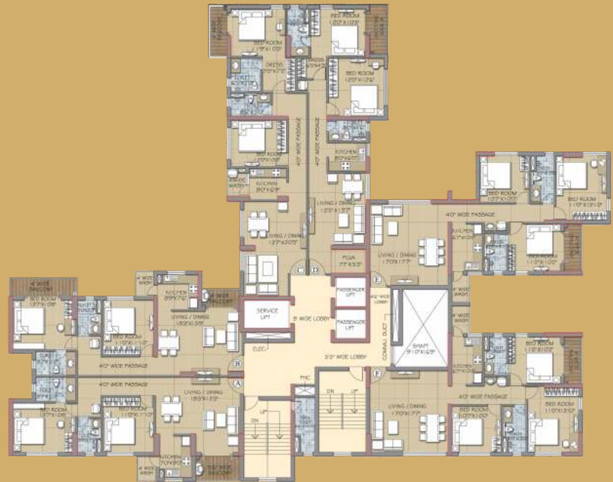
Typical floor plan | Wing - A | 1 st to 23 rd