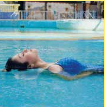
Swimming Pool with Jacuzzi & Kids' Pool