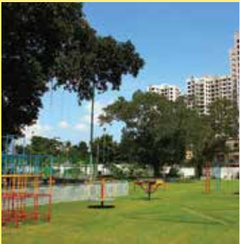
Children's Play Arena