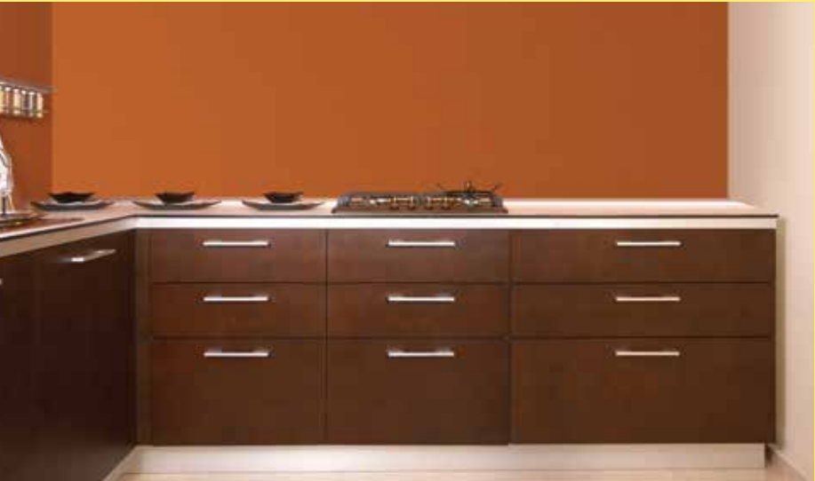
◀ Basic Modular Kitchen