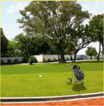
Golf putting green with driving range