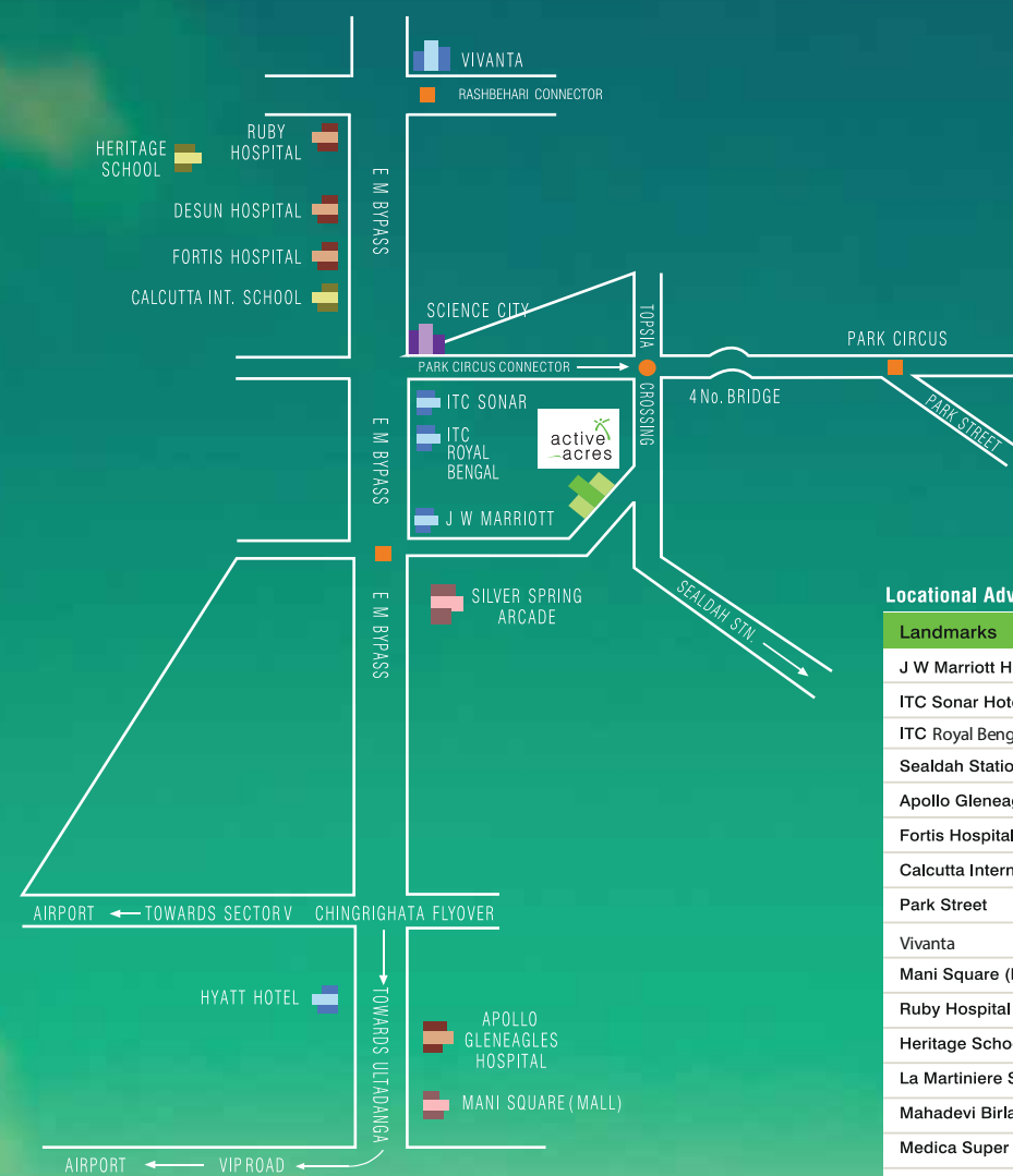
Locational Advantages of Active Business Park